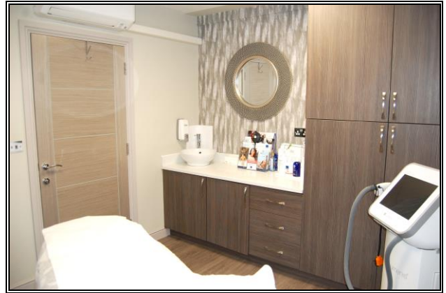
Ground Floor Rear Treatment Room