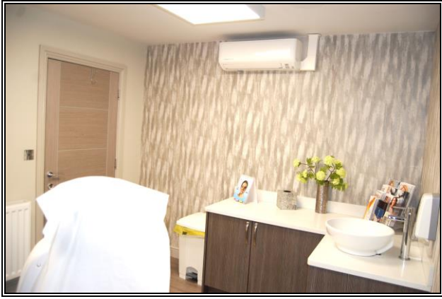
Mezzanine Front Treatment Room