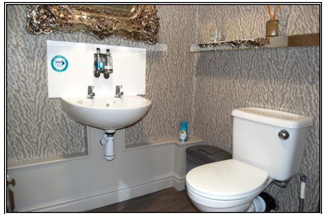
Ground Floor WC