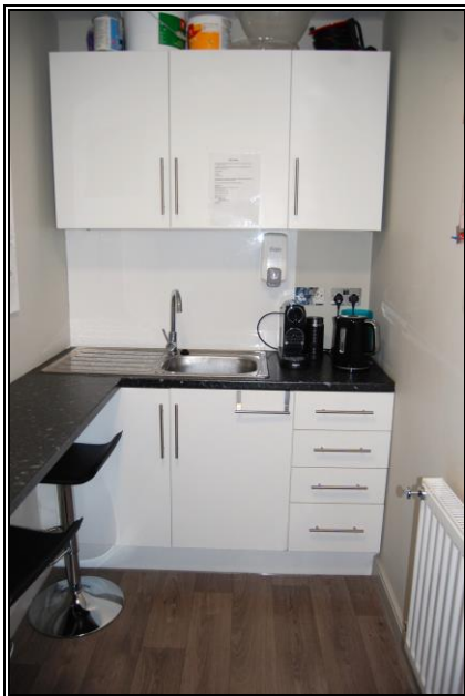
Ground Floor Kitchen